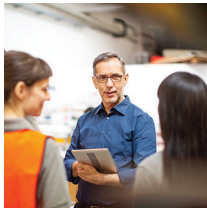
ILLUSTRATION & MULTIMEDIA

Whether you need us to create new content or enhance your legacy data, ONEIL maximizes value with integrated solutions tailored to your specific requirements. Our team of project managers, technical writers, catalogers, and illustrators simplifies the process with decades of experience and valuable mechanical, engineering, and military backgrounds.