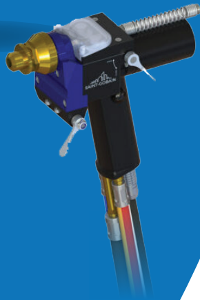
Master Jet® 3s